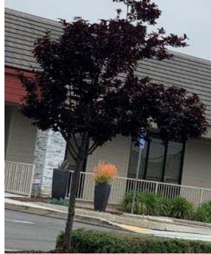
Purple Leaf Plum

Purple-leaf plum trees , also called cherry plums or flowering plum trees , can add interest to your yard or garden with their dark red to purple foliage and abundance of white to light pink spring blossoms. Purple-leaf plums are medium-sized, deciduous trees primarily used for ornamental purposes.