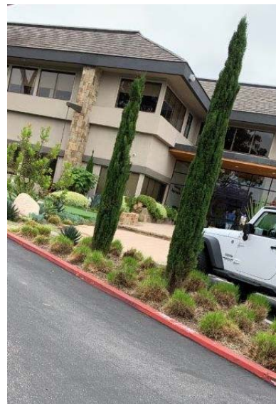
Cupressus Tiny Towers

'Tiny Tower' is a very slow growing, unique, more compact form of Italian Cypress that grows only 8 ft. tall after 10 years, eventually achieving a height of 25 ft. The rigid columnar form of dense deep blue-green foliage is a valuable accent in any location. Requires no maintenance but responds well to topiary applications